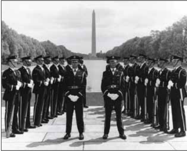
Undated photo of the USAF Honor Guard Drill Team at the Washington Monument. Circa 1960s

The Honor Guard traces its beginning to May 1948 when Headquarters Command USAF was instructed to develop plans for an elite ceremonial unit comparable to those of the other armed services. As a result, a ceremonial unit was activated within the Air Police Squadron in September 1948 with an authorized strength of 98 enlisted and two officers. However, due to transfers and personnel attrition, the end of the year found the Ceremonial Detachment, for all practical purposes, disbanded. It wasn't until March 1949 that sufficient personnel were assigned to enable the unit to function. The Ceremonial Detachment continued to be assigned to the Air Police Squadron until December 1971. Finally, on January 1, 1972, the Honor Guard came into its own as a separate unit. Today's Honor Guard is comprised of volunteers who are carefully screened for their ability and physical dexterity. Only those persons who are highly motivated and maintain an exceptionally high standard of appearance, conduct, and aptitude for ceremonial duty are considered.